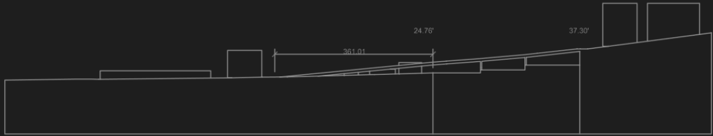
Denny Way Section